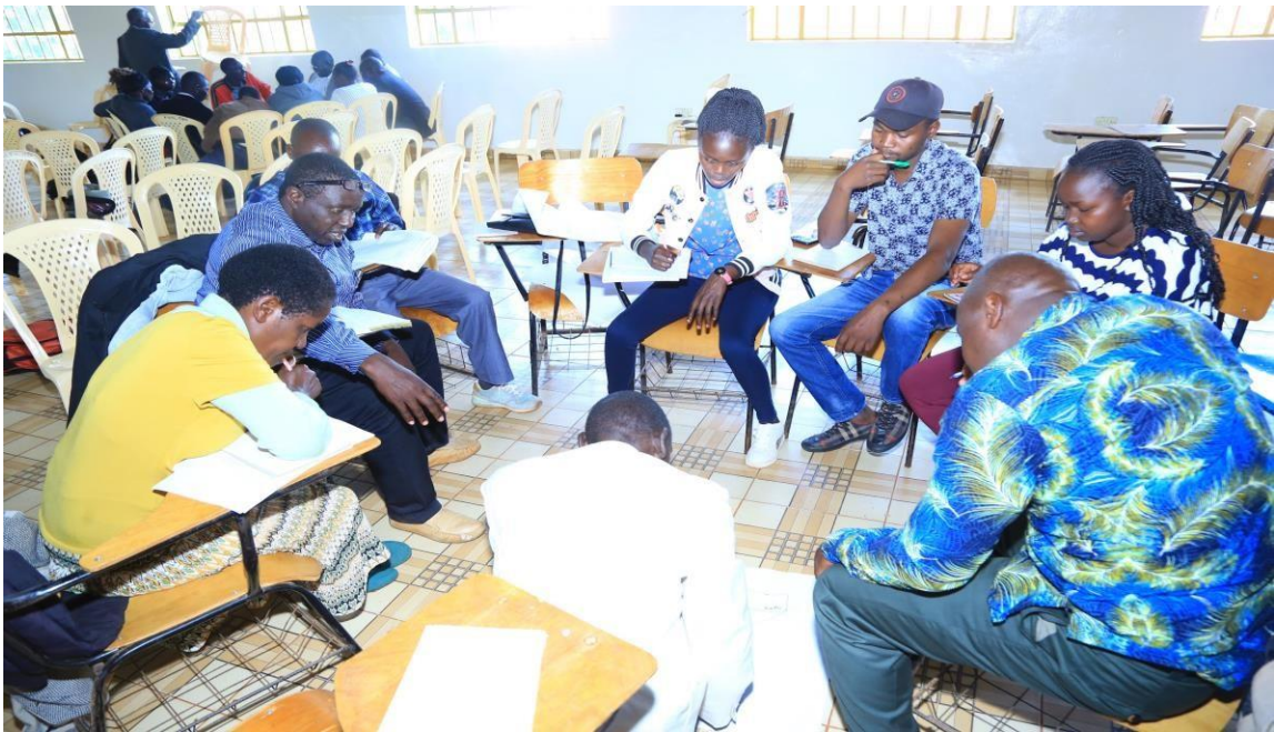
Figure 2: Community Engagement on Climate Change Action Plan