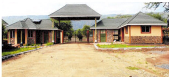
The main entrance to Rimoi National Game Reserve in Elgeyo Marakwet County. The park is home to East and Central Africa's largest herd of elephants.

unique as it has been established by wildlife scientists as a breeding ground for elephants that trout to the sanctuary from neighbouring Turkana and Samburu counties.